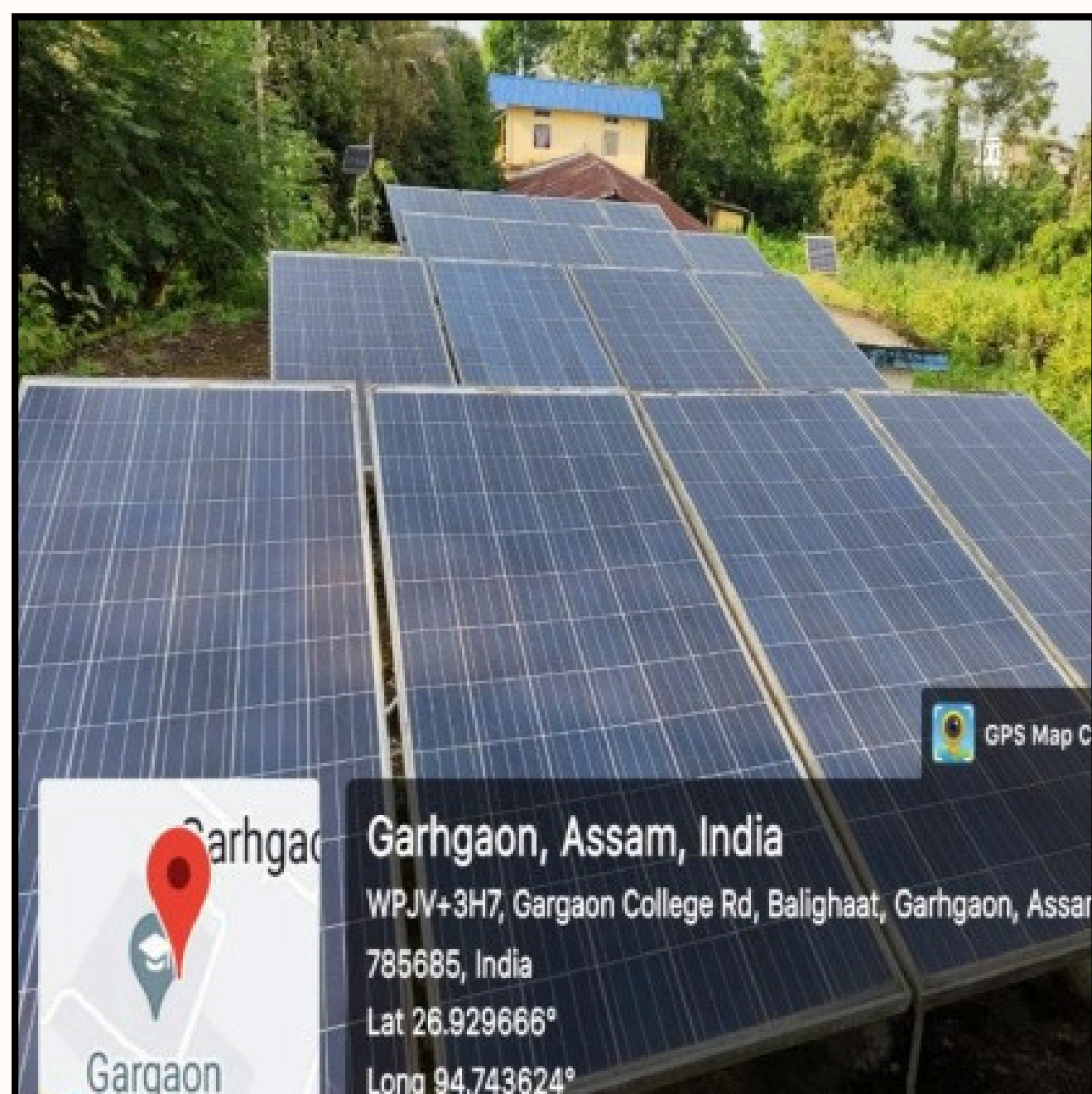
Installation of Solar Panels