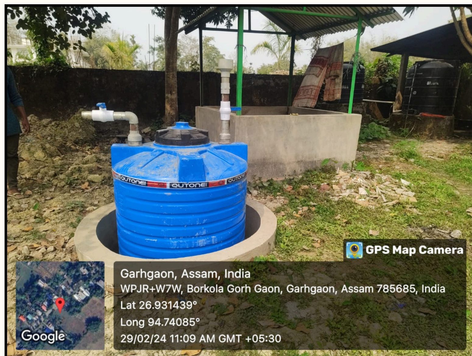
Picture: Biogas plant in campus