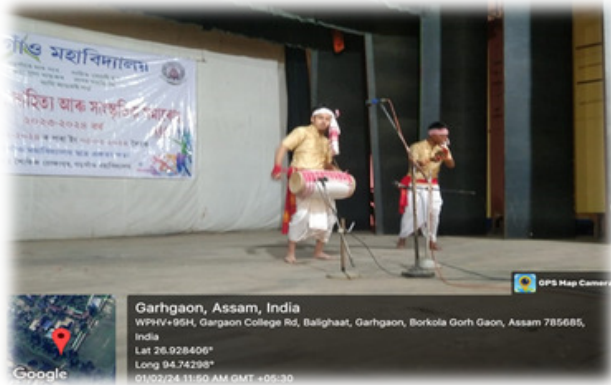
Photo Gallery of Cultural Events

গড়গাঁও মহাবিদ্যালয় GARGAON COLLEGE NAAC accredited with 'B' Grade